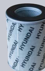
Hydraulic filter (1,000 hr)

9 series wheel loaders can be equipped with optional full rear fenders and front and rear mud flaps to reduce material splatter to the cab and machine frame.