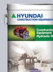
Hydraulic Oil (5,000 hr)