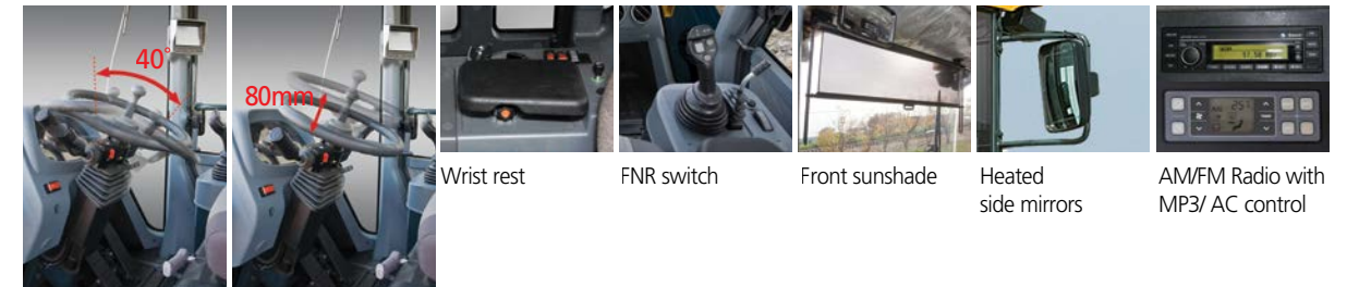
Tilting / telescopic steering column

In the 9 series cabin you can easily adjust the steering column and wrist rest to best suit your preferred comfort level. Pilot-operated joystick controls are easy and comfortable to operate. An FNR (Forward/Neutral/Reverse) switch on the control lever facilitates easy selection of travel direction. Roller type sunshades on the front window and rear window allow the operator to reduce glare and improve visibility. Heated side mirrors feature built-in hot wires for quick defrosting during cold weather conditions.