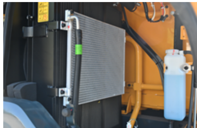
The cooling fan diameter and number of blade (7 to 9) increased for better heat dissipation.

The maximum flow rate of the main pump is 158.4+17.6lpm. New load sensing system provide faster independent action a low fuel consumption.