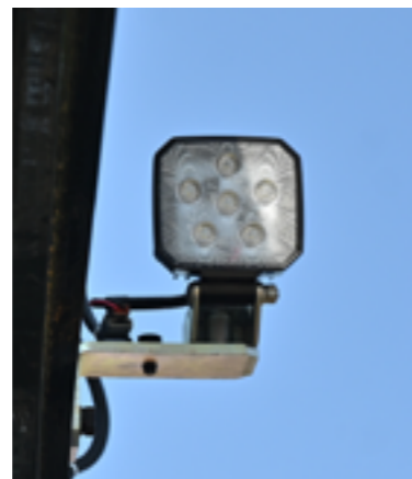
Standard LED Lamp