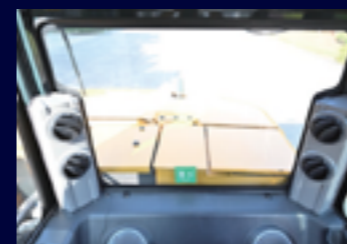
Better Rear Visibility

In order to reduce the fatigue of the driver's performance, HX75S provides a comfortable operating environment for the pilot.