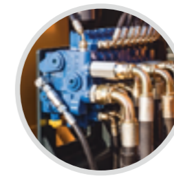
Reduced Noise, Improved Heat Dissipation