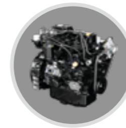
High-Performance Yanmar Engine