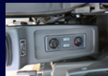
Improved Air Conditioning System