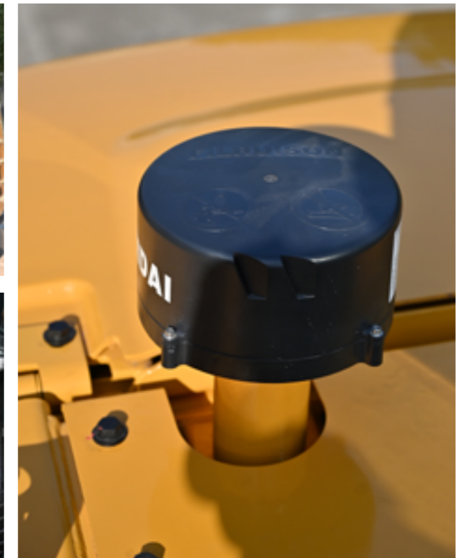
Fold-back air pre-filter