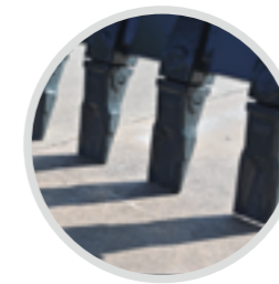
Reliable Bucket Pin Type