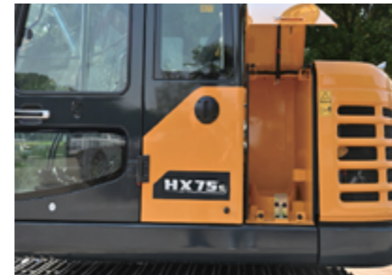
Additional storage or grease gun

HX75S has fully open hood for convenient maintenance