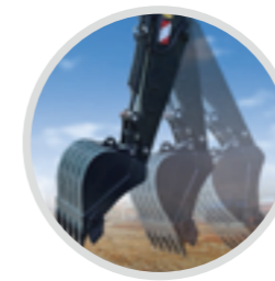
Grading Efficiency Improved