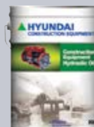
Hydraulic Oil (5,000 hr)