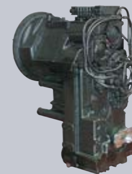
Fully Automatic Transmission

The CUMMINS QSM11 electronic control engine combines full-authority electronic controls with the reliable performance. The combination of improved airflow and evenly dispersed fuel results in increased power, improved transient response and reduced fuel consumption. And the QSM11 uses advanced electronic controls to meet the emission standards. (EPA Tier-3, EU Stagelll-A)