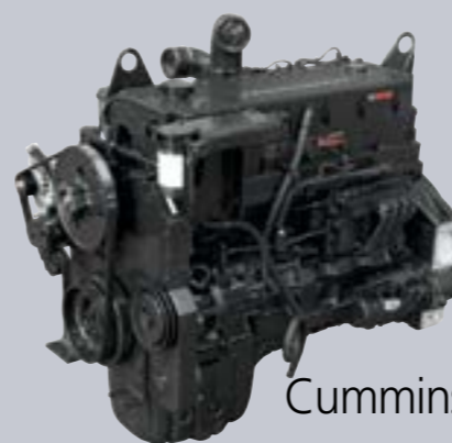
Eco-friendly Cummins QSM11 Engine

3 Mode Clutch Cut-Off System L(Low) Mode : Short distance & faster loading M(Medium) Mode : General loading H(High) Mode : Slope ground & inching