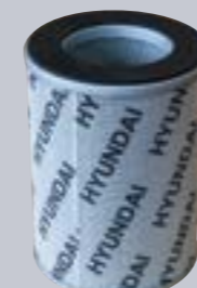
Hydraulic filter (1,000 hr)

Conveniently located coolant and transmission oil site gauges make checking fluid levels fast and efficient. Ground-line access to fuel and oil filters grease fittings, fuses, machine computer components and wide open compartments makes service more convenient on the 9 series.