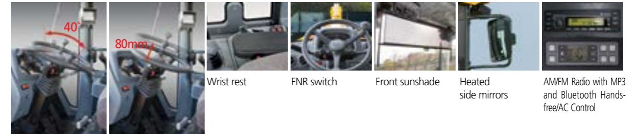
Tilting / telescopic steering column

In the 9 series cabin you can easily adjust the steering column and wrist rest to best suit your preferred comfort level. Pilot-operated joystick controls are easy and comfortable to operate. An FNR (Forward/Neutral/Reverse) switch on the control lever facilitates easy selection of travel direction. Roller type sunshades on the front window and rear window allow the operator to reduce glare and improve visibility. Heated side mirrors feature built-in hot wires for quick defrosting during cold weather conditions.